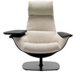
Massaud Work Lounge