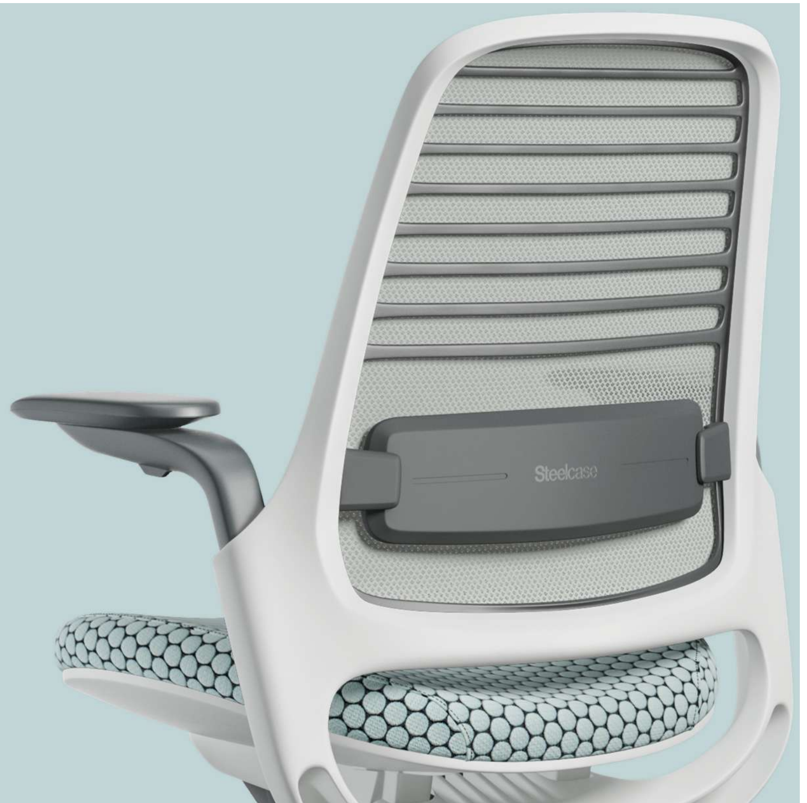
Steelcase Series 1