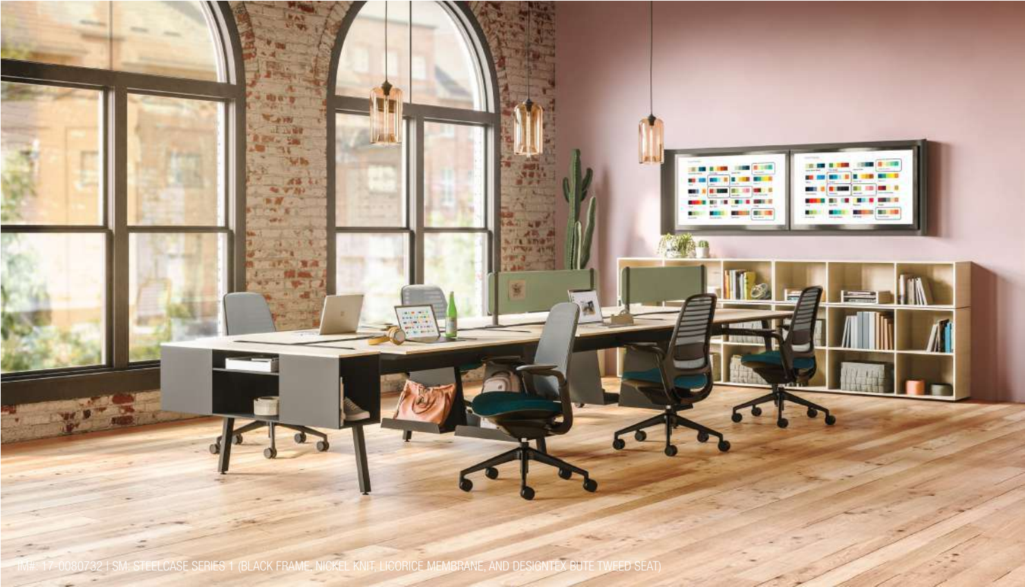
TM# 17-0080732 | SM: STEELCASE SERIES 1 (BLACK FRAME, NICKEL KNIT, LICORICE MEMBRANE, AND DESIGNTEX BUTE TWEED SEAT)

Best in class. A new class. By Steelcase.